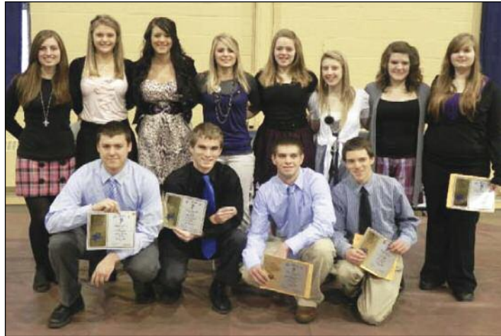
St. Pius X High School Gold Star Seniors have earned Gold Honors in the in-school Renaissance Program for the seven semesters they have completed. The program promotes academic achievement, Honor code behavior and fulfillment of a minimum of twenty-five service hours per year.