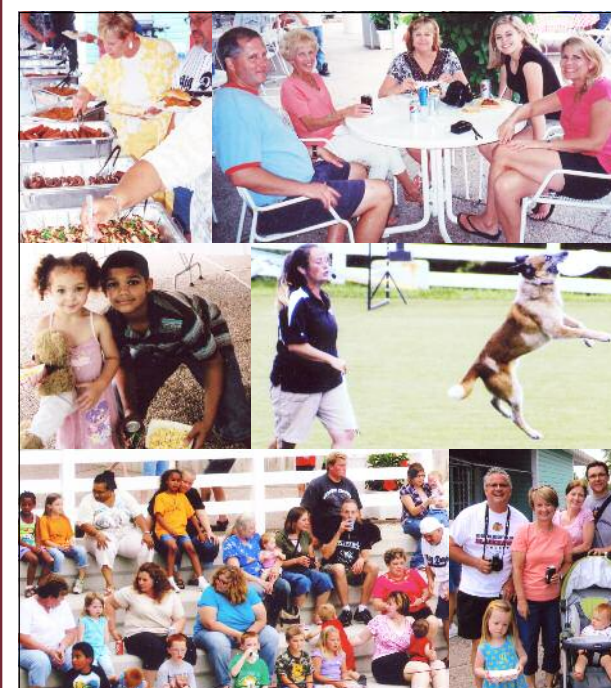
Annual Picnic 2010

We will have wagon rides, a dog show, music and delicious food and thirst-quenchers. Employees have a chance to win the fantastic prizes that our suppliers donate. Be sure to let your Manager know if you can attend.