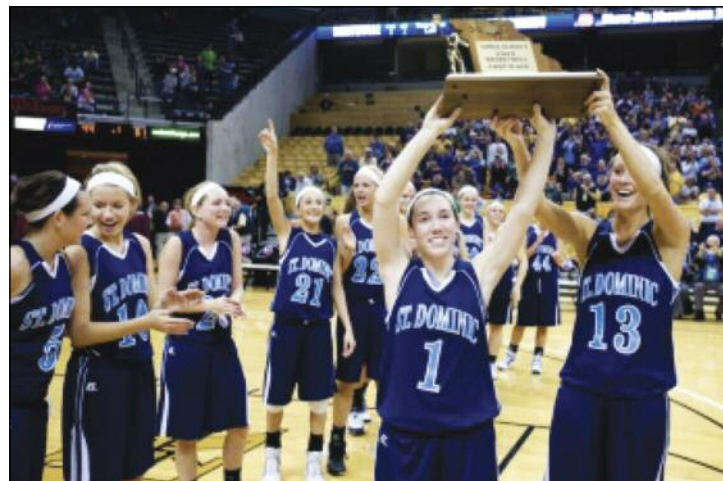
The St. Dominic High School girls basketball team won Class 4 state championship after defeating Smithville at Mizzou Area March 12.