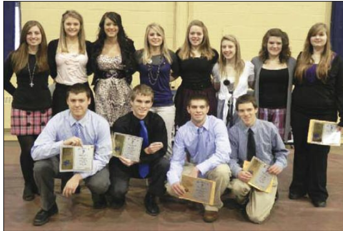
St. Pius X High School Gold Star Seniors have earned Gold Honors in the in-school Renaissance Program for the seven semesters they have completed. The program promotes academic achievement, Honor code behavior and fulfillment of a minimum of twenty-five service hours per year.